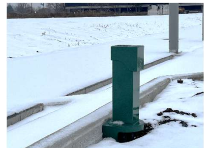
Fully installed Foundation Mounting Bracket with 5x5 Surface Mount Power Pedestal