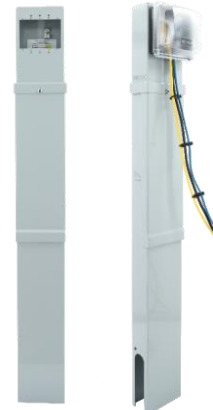
Devices and covers not supplied